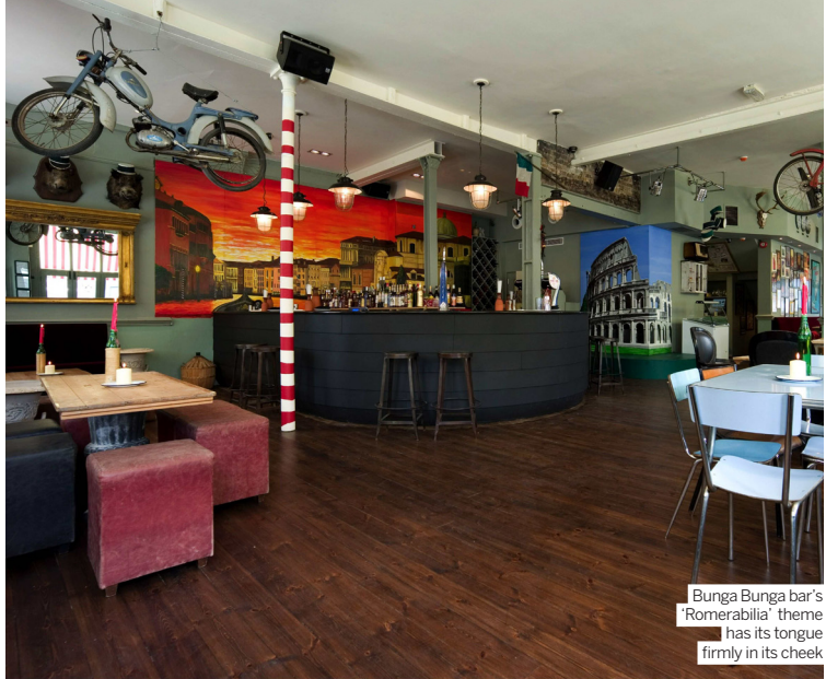
Bunga Bunga bar's "Romerabilia" theme has its tongue firmly in its cheek