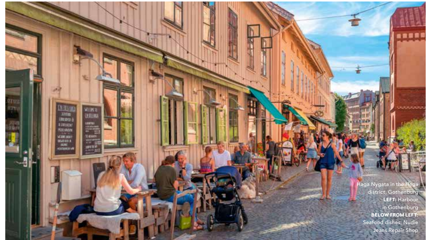
Haga Nygata in the Haga district, Gothenburg LEFT: Harbour in Gothenburg BELOW FROM LEFT: Seafood dishes; Nudie Jeans Repair Shop