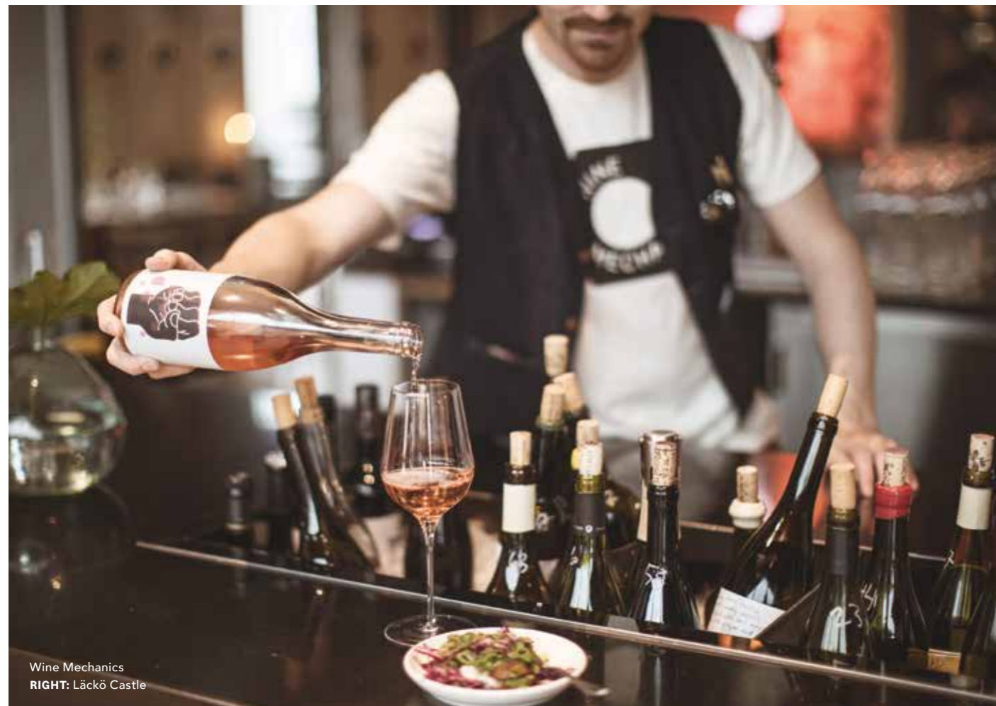
Wine Mechanics RIGHT: Läckö Castle