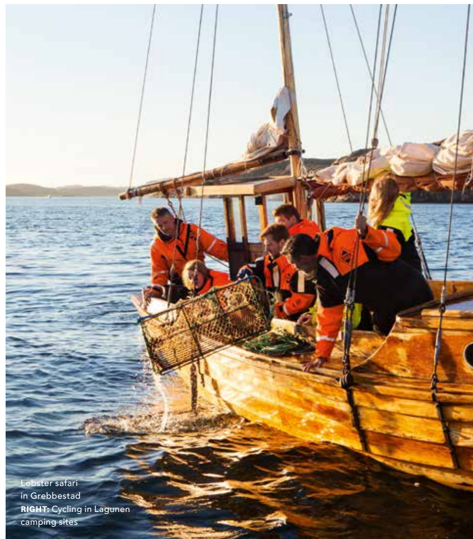
Lobster safari in Grebbestad RIGHT: Cycling in Lagunen camping sites

SKÄRGÅRDSIDYLLEN offers kayaking and paddleboarding experiences. skargardsidyllen.se EVERTS SJÖBOD conducts seafood safaris, fishing trips and boat adventures. evertssjjobod.se westsweden.com/paddling