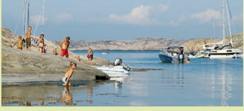
Travelling by boat makes it possible to explore a multitude of beauty spots in the archipelago

Welcome to Kosterhavet and Ytre Hvaler national parks, a unique natural marine environment shared by Sweden and Norway. Boating in the national parks provides wonderful opportunities to experience the magnificent archipelago and sea. As a traveller at sea, you can contribute to preserving the parks' valuable nature for the future!